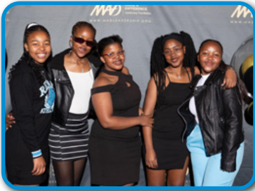
Students at the 2023 MAD Gala Dinner to celebrate 20 Years of Making A Difference