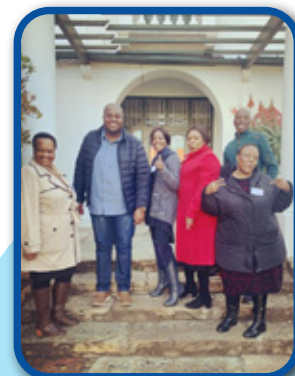
uBambiswano Head and principals from our partner schools