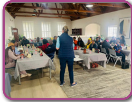
Our Executive Head welcoming the maths teachers to St Andrew's