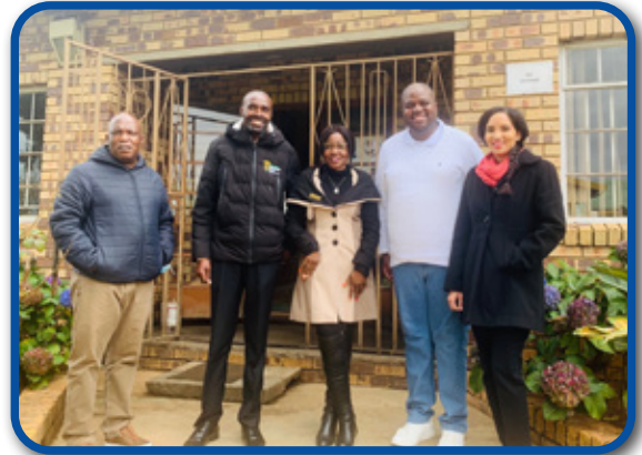
Inkatha ka Zulu Management team, Head of uBambiswano, PA to the Head of uBambiswano