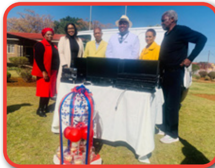
The management team of Daveyton Intermediate School & Staff members from Suzuki Bruma