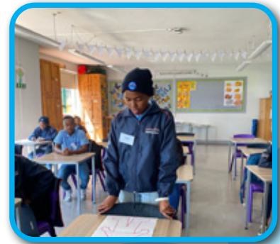
Students sharing business ideas