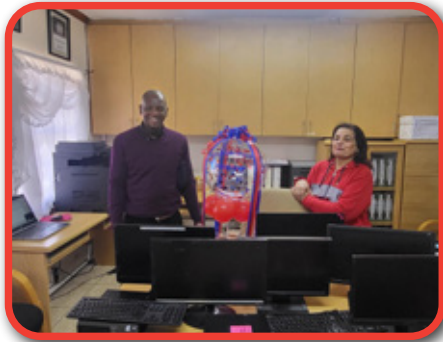
The management team of Moshoeshoe Primary School

uBambiswano would like to thank Supergroup Dealerships for donating 35 computers to five of our partner schools in Daveyton and Etwatwa. The deliveries were made to Daveyton Intermediate School, Inkatha ka Zulu Primary School, Enkangala Primary School, Madingoane Primary School and Moshoeshoe Primary School by Suzuki Bruma , who are part of Supergroup Dealerships. We appreciate the continued support that we receive from Supergroup Dealerships.