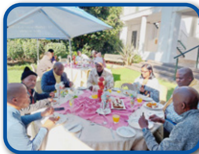
Deputy Principals sharing good practices & enjoying lunch