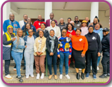
Maths teachers from our partner schools in Daveyton & Etwata

uBambiswano hosted a Maths workshop for teachers from our partner schools in Daveyton and Etwatwa. The workshop's theme was 'Pouring From A Full Cup' . Delegates included both Foundation Phase and Intermediate Phase teachers. We would like to thank Ntokosi Skills Development and Spirit Animals for their excellent input at the workshop.