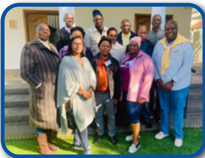
Deputy Principals from our partner schools in Daveyton & Etwatwa

We also hosted a discussion forum for 10 Principals from our partner schools in Daveyton and Etwatwa. The forum's theme was 'Leading through Adversity'. The Principals joined each other in the spirit of collegiality, benefitting from connectedness and time with others who know how it feels to lead a school at this time. Participants left feeling enriched, inspired, and with a renewed sense of purpose and hope.