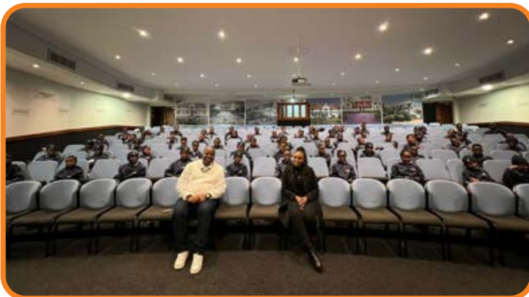
The Youth Month assembly was held in the Alister Rogan Auditorium