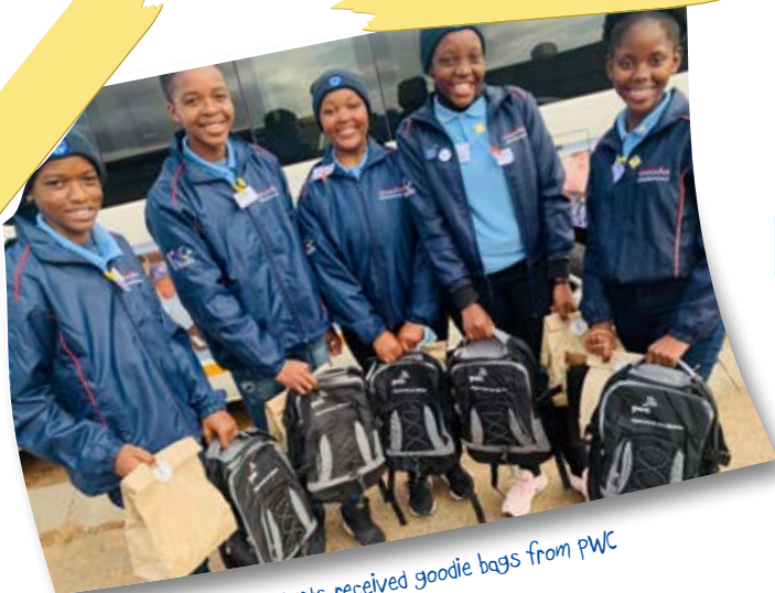
Grade 9 students received goodie bags from PwC