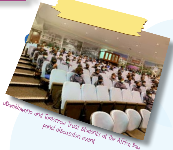
uBambiswano and Tomorrow Trust students at the Africa Day panel discussion event