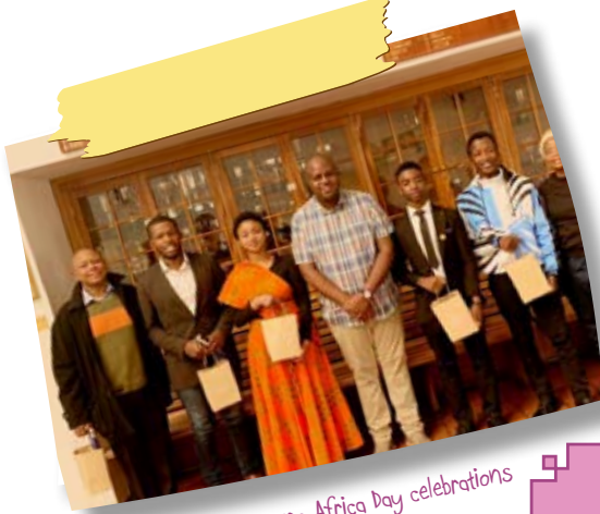
uBambiswano Africa Day celebrations

The Africa Day celebrations were truly special.