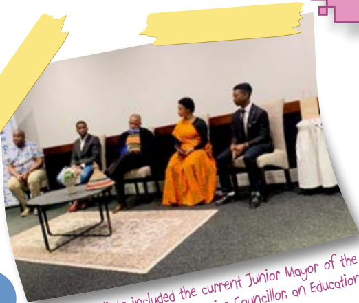
The panelists included the current Junior Mayor of the city of Johannesburg, a Junior Councillor, an Education consultant and a property entrepreneur