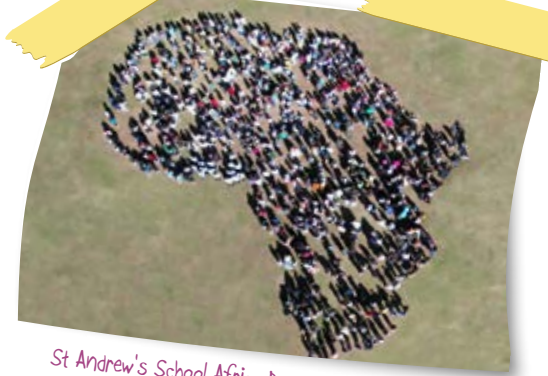
St Andrew's School Africa Day and Harvest Festival celebrations