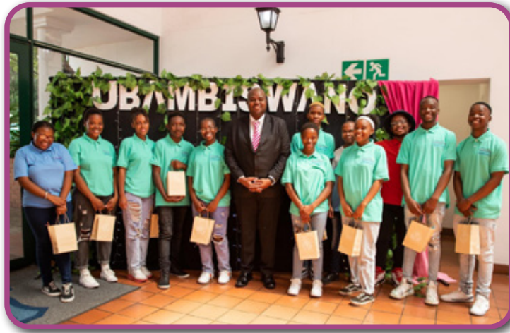
The Tomorrow Trust Saturday School Programme's 2022 matric group

Congratulations to The Tomorrow Trust Saturday School Programme's 2022 matric group, who achieved a 92% pass rate in the National Senior Certificate (NSC) Examinations (76% of their students received Bachelor's Degree passes). All past students who came through the uBambiswano programme passed with exceptional results .