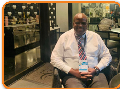
Sipiwe Vilakazi attending the Department of Basic Education 2023 Lekgotla at the Sandton Convention Centre