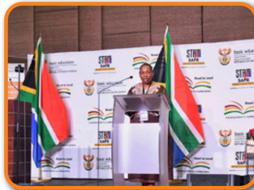
Minister of Basic Education Mrs Angie Motshekga welcoming delegates at the 2023 Lekgotla