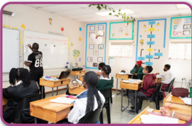
Committed students of The Tomorrow Trust

We recognise and applaud every student who worked incredibly hard to achieve their personal best.