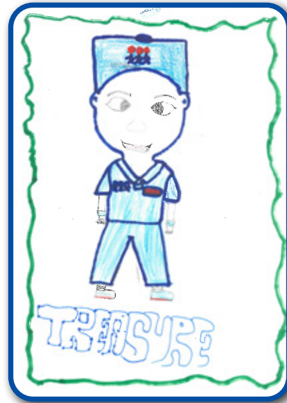
Treasure - Self portrait