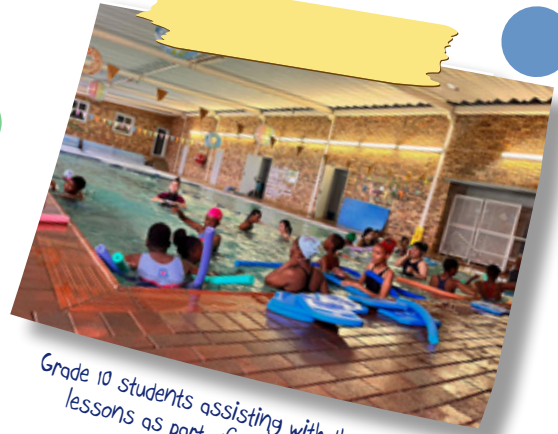
Grade 10 students assisting with the swimming lessons as part of their Skilled for Life Programme