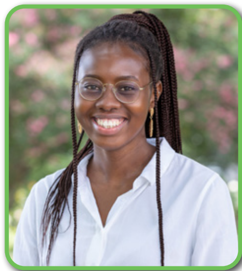
Six Magula Art and Entrepreneurship