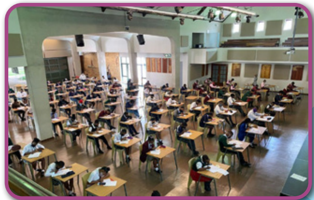
The Tomorrow Trust matric students writing their baseline assessments