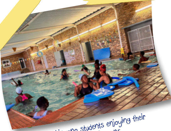
uBambiswano students enjoying their swimming lessons

Swimming is such an important life skill and we are so fortunate to have wonderful resources through St Andrew's to offer our uBambiswano students swimming lessons as part of their extra curricula programme. We use services of certified professional swimming instructors and, in addition, the Grade 10 St Andrew's students volunteer to assist with the swimming lessons as part of their Skilled for Life Programme . This also gives them an opportunity to interact with uBambiswano students, which is always pleasing to see.