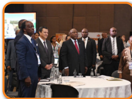
President Cyril Ramaphosa delivered a keynote address at the 2023 Lekgotla