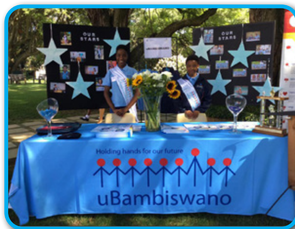
Grade 9 students representing uBambiswano at the St Andrew's School Open Day

St Andrew's held their Open Day on 28 January 2023, and it was wonderful for uBambiswano to be part of it. We set up an information desk, at which we were represented by our Grade 9 students who worked in shifts throughout the day. Who better to market us than our students? Our students did a wonderful job. They happily chatted to prospective parents and students who enquired about uBambiswano, explaining who we are, what we do, our work in the communities of Daveyton and Etwatwa, and our relationship with St Andrew's.